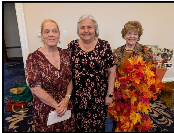
Annual Fall Celebration