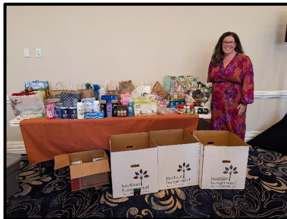
Loudoun Hunger Relief Annual Fall Celebration